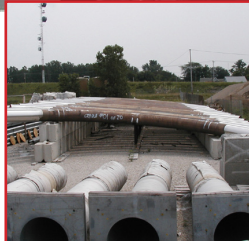
CRADLES & SADDLES