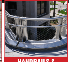
HANDRAILS & CURB COVERS

AMECO USA is a premier supplier of cable-stay components for major bridge projects across the U.S. including: